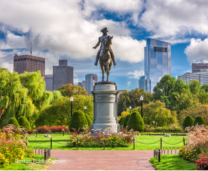
Boston Public Garden