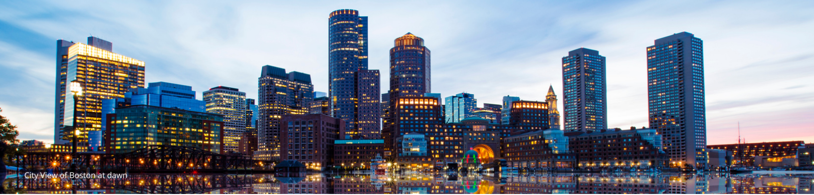
City View of Boston at dawn