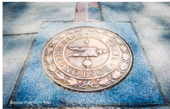
Boston Freedom Trail