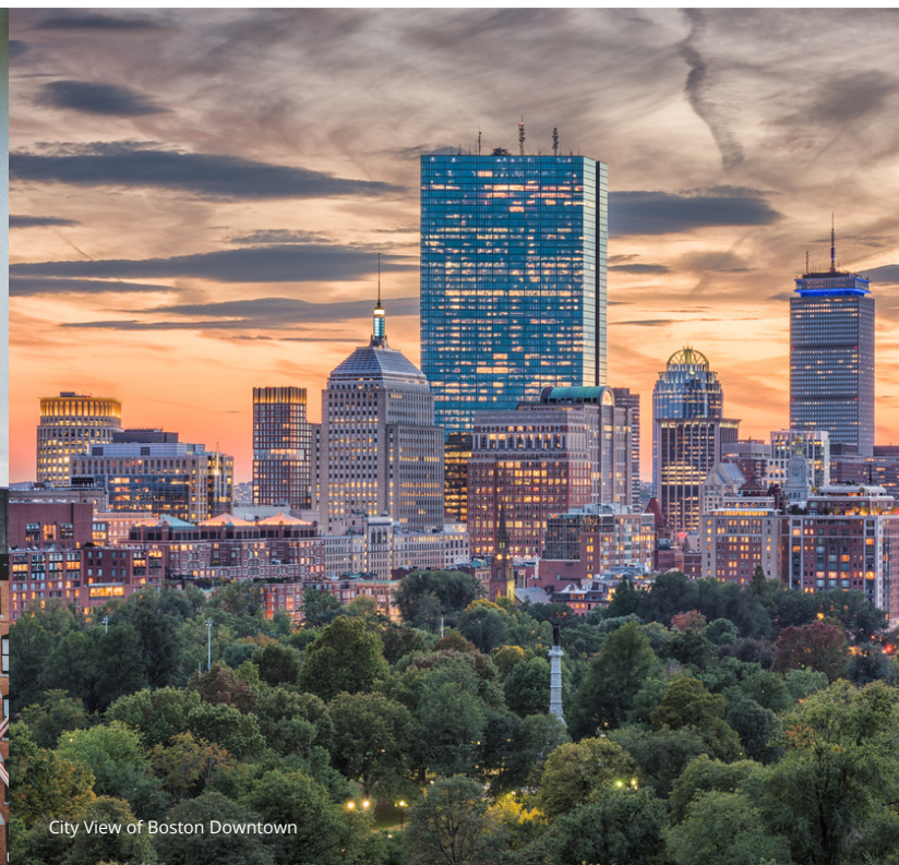
City View of Boston Downtown