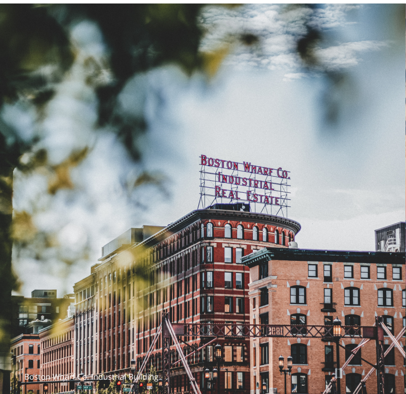
Boston Wharf Co. Industrial Building

Find out more about Boston on bostonusa.com