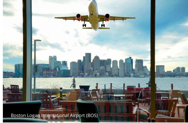
Boston Logan International Airport (BOS)

Follow us on Social Media and help spread the word about the Congress.