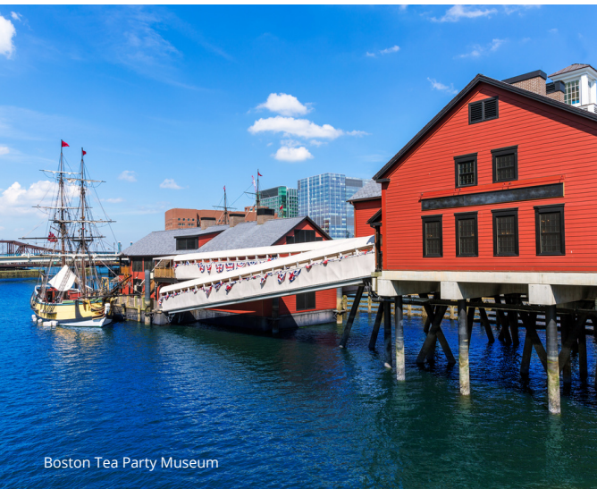
Boston Tea Party Museum

The World Congress of Veterinary Dermatology provides an unparalleled opportunity to meet with leading international experts for four days of networking and learning about the latest innovations in science and practical applications for veterinary dermatology. Join us at WCVD10 in Boston, Massachusetts in July 2024. The Congress promises to be an exciting and rewarding opportunity to come together.